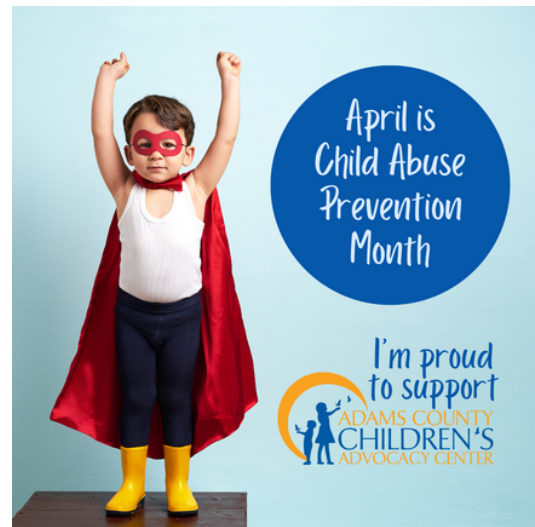
Support Post #2