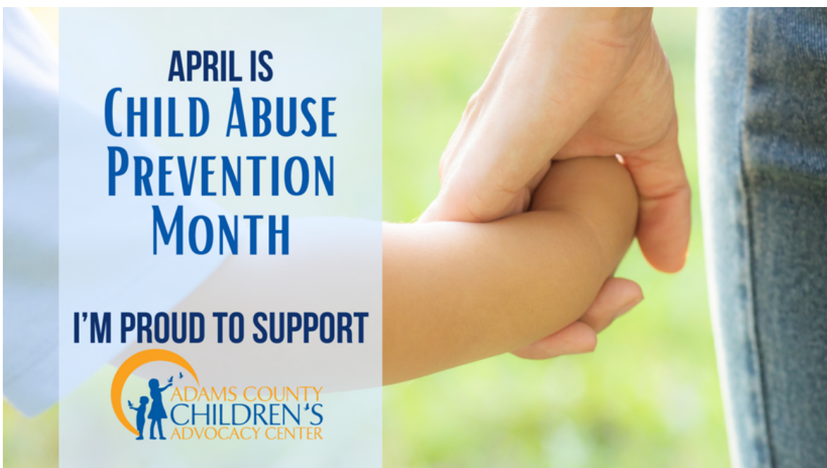
Facebook Cover Photo