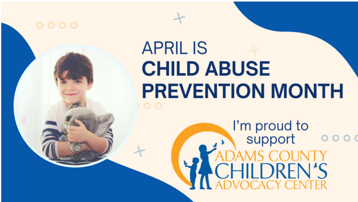
Facebook Cover Photo

Remember to tag @kidsagaincac and use hashtags: #ChildAbusePreventionMonth #BrighterTomorrowsCAC