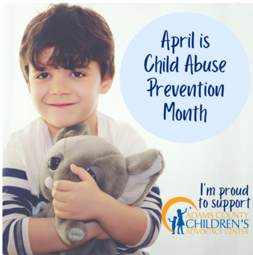
Support Post #1