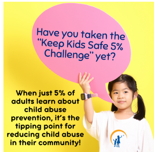
5% Challenge #2